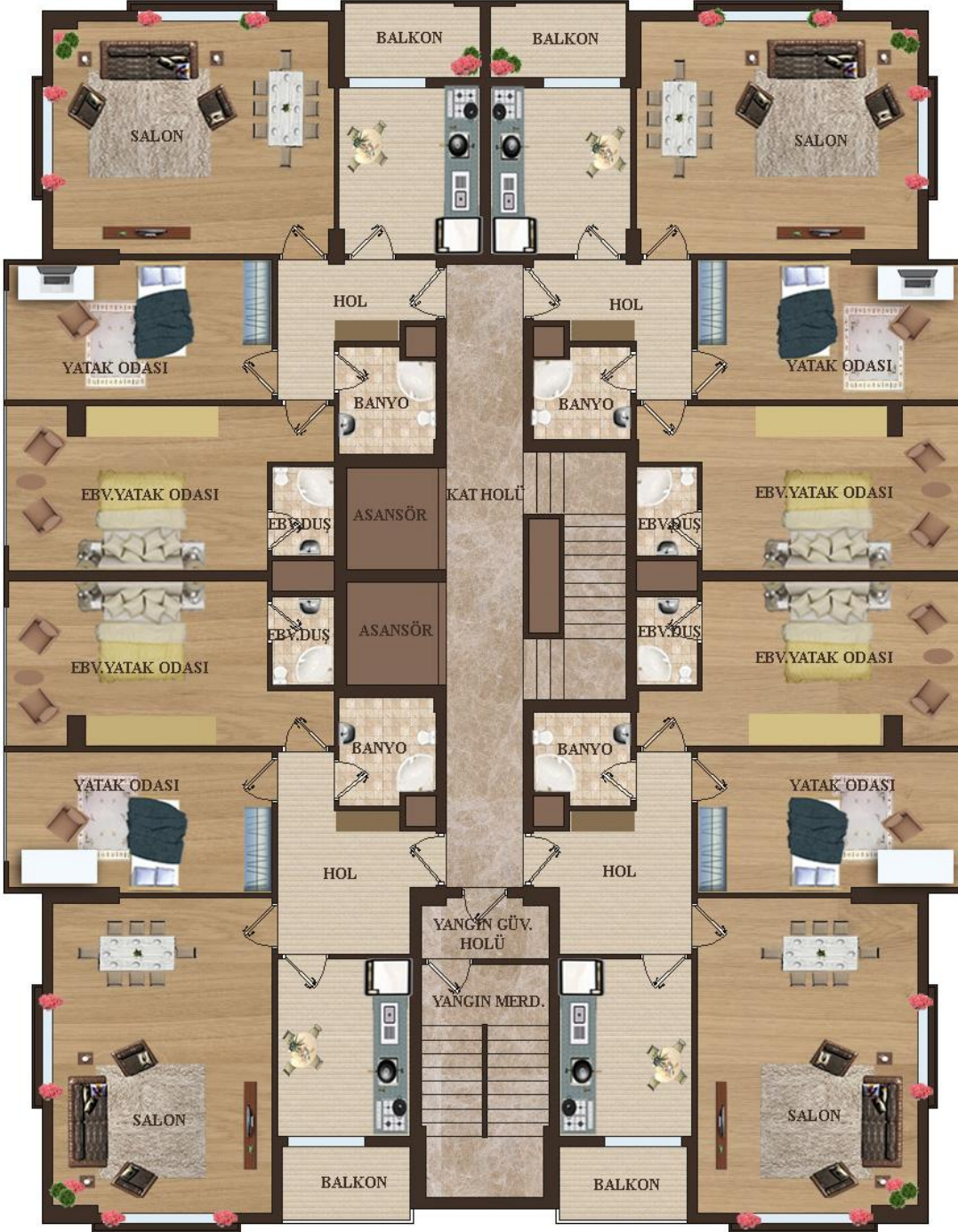
B BLOK BRÜT ALAN:107.03 m 2